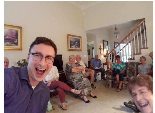
Having a great time with parishioners listening to their thoughts and concerns!